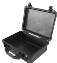
Cable plastic case