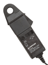
Current clamp 30 / 300 A + cable set 5 m