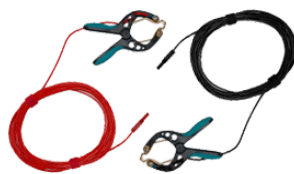
Voltage sense cables with TTA clamps