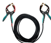
Current connection cable