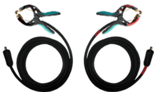
Current cables with TTA clamps