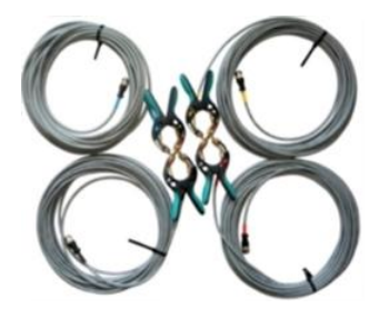
H winding test cable set

All specifications herein are valid at ambient temperature of + 25 °C and recommended accessories. Specifications are subject to change without notice Specifications are valid if the instrument is used with the recommended set of accessories