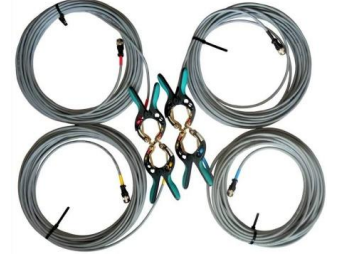
X winding test cable set