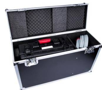
Set of 4 current cables with TTA clamps