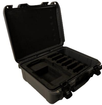
Plastic transport case for TWR-H, TRT-H & RMO-TH