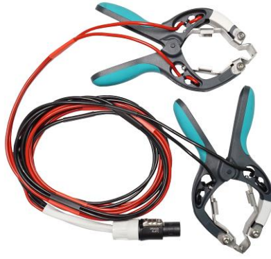
X winding current and sense cables with TTA clamps