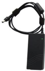
Power supply adapter