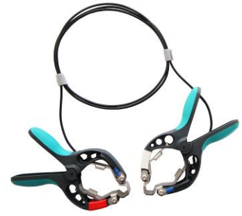
Jumper cable with TTA clamps