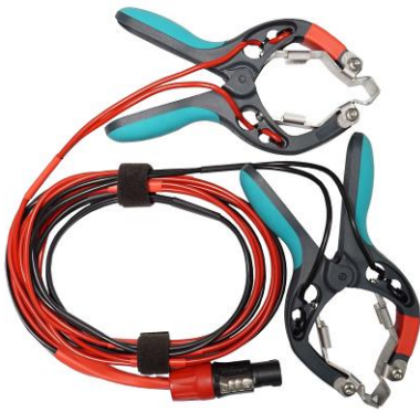
H winding current and sense cables with TTA clamps